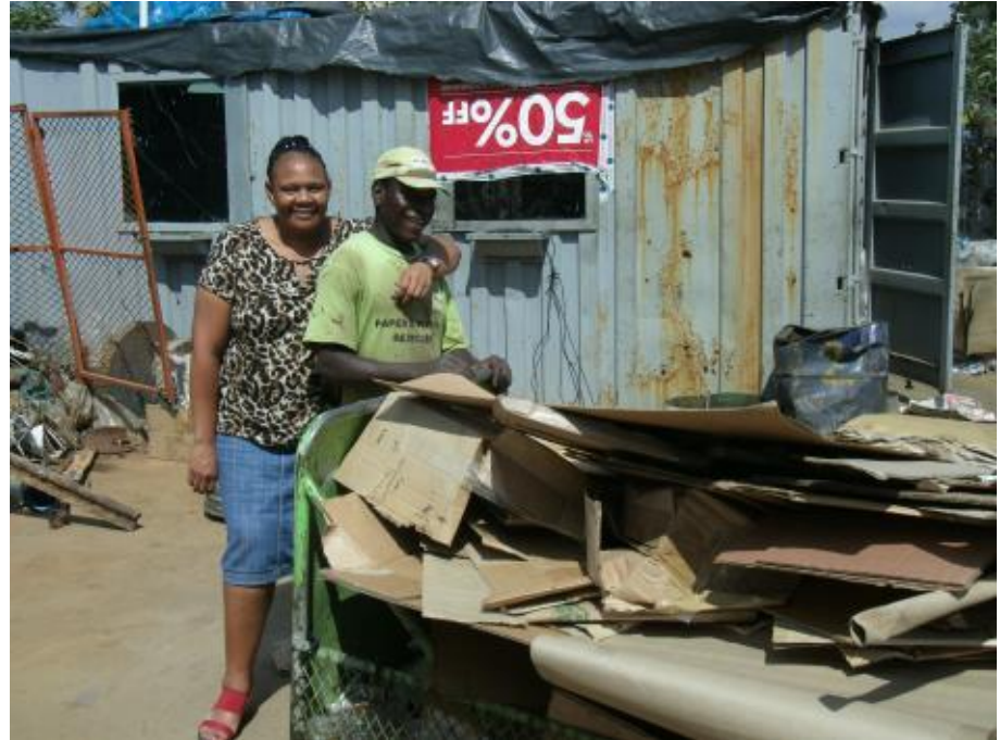
Queen's buy-back centre in Robertville